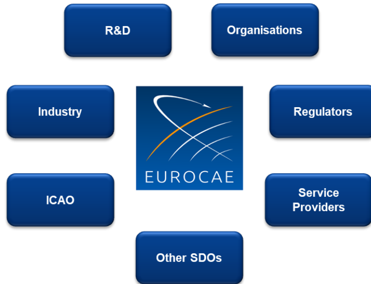
FIGURE 2: EUROCAE STAKEHOLDERS

EUROCAE is working in an ecosystem of many aviation stakeholders. It is important for the organisation to understand the community's needs and trends, to initiate the timely development of appropriate standards and prioritise activities. Building and maintaining strong collaborative relationships with our members and other key partners is therefore an important element of our work.