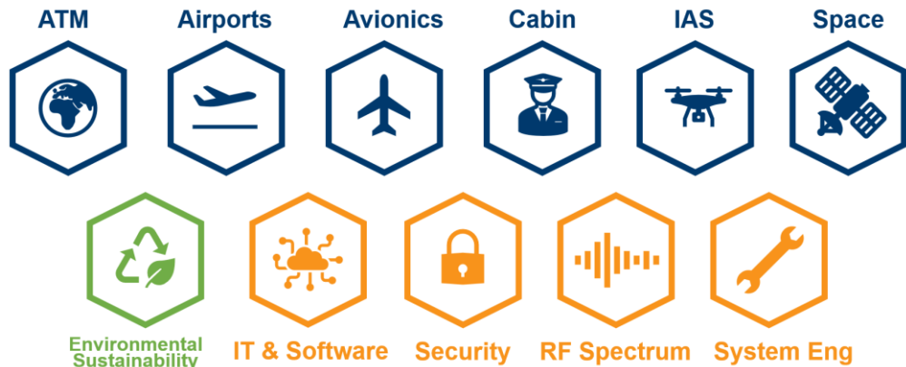
FIGURE 3: EUROCAE TECHNICAL DOMAINS

EUROCAE activities have been classified into the 11 domains, as per the following figure: